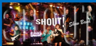
Live music by "Shout!" 2-5 p.m.